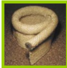
Very High Temperature TadpoleTape™. 1500°F / 815°C Page 6