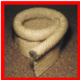
Very High Temperature Fiberglass Precision TadpoleTape™. 1000°F / 537°C Page 5