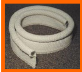
High Temperature & Chemical Resistance PTFE Coated TadpoleTape™. 550°F / 287°C Page 2