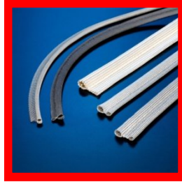
Very High Temperature Fiberglass Precision TadpoleTape™ Gaskets. 1000°F / 537°C Page 1