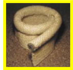
Extreme Temperature TadpoleTape™ 2000°F / 1093°C Page 7