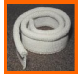
Fiberglass "Tacky Cloth" TadpoleTape™. 550°F / 287°C Page 4